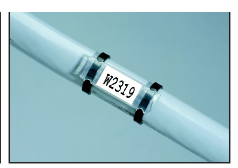
PM-sleeve with a label from a PF-sheet