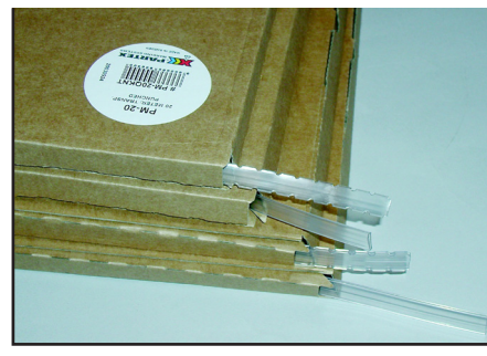
Continuous PM profiles in flat "pizza" cartons