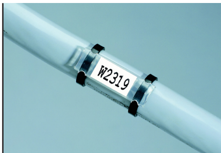
PM-sleeve with a label from a PF-sheet