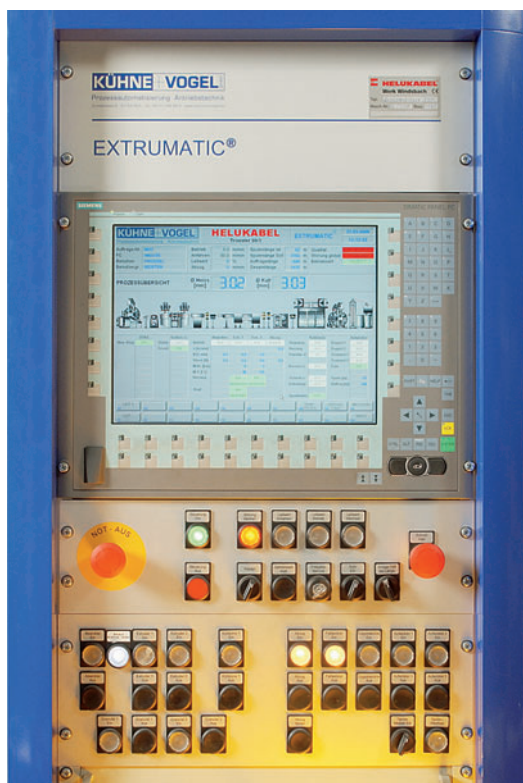
Standardised process control and visualisation of an extrusion system at our Windsbach factory.

Dimensions and specifications may be changed without prior notice. (RB01)