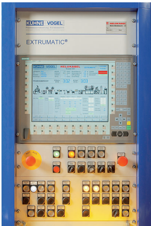
Standardised process control and visualisation of an extrusion system at our Windsbach factory.

Dimensions and specifications may be changed without prior notice. (RB01)