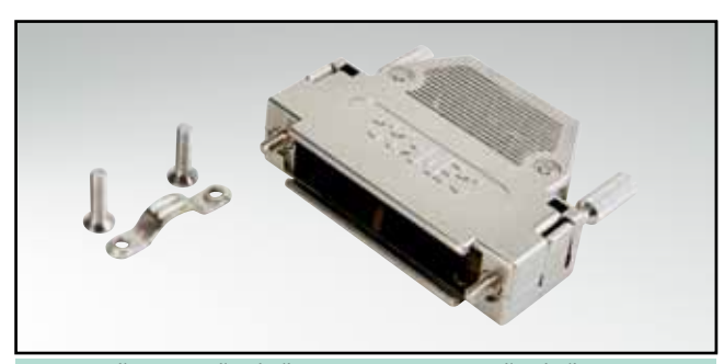
RoHS compliant - CSA listed, File No.: LR 115000-1 - UL listed, File No.: E202784

Straight cable entry - 9-50 pos. - With jack screws