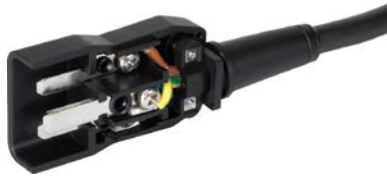
Example with assembled cable